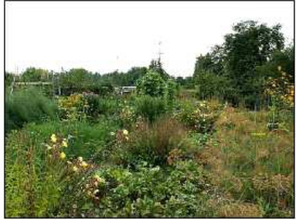
Figure 1: Examples of Photo's of Manicured (Top Row), Romantic (Middle Row), and Wild (Bottom Row) Gardens used in Study 1.